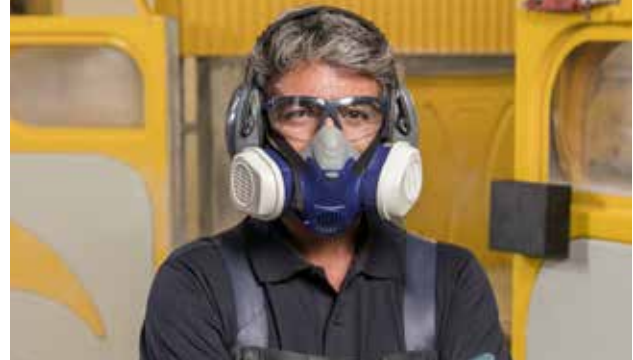
Half face respirator